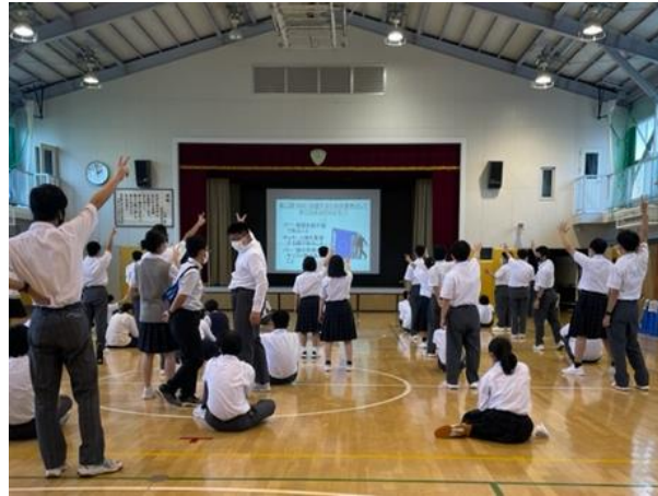
The winner of the quiz received EU-themed items