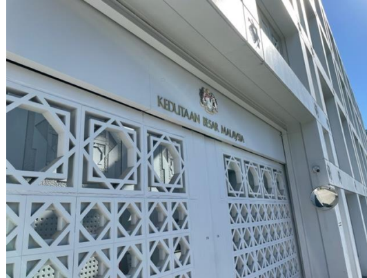
Exterior of the Embassy of Malaysia in Japan