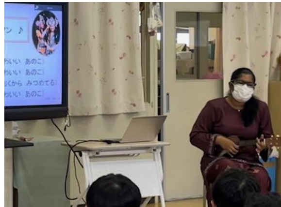
Singing a Malaysian song, " Rasa Sayang ," while playing the ukulele