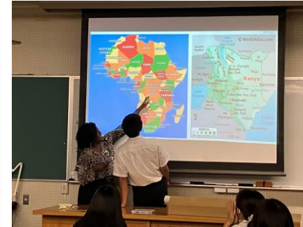
A game to find countries on the African continent