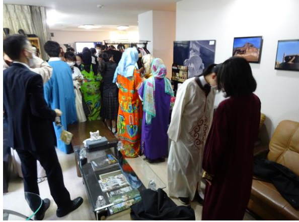
Students enjoyed experiencing the colorful traditional costumes