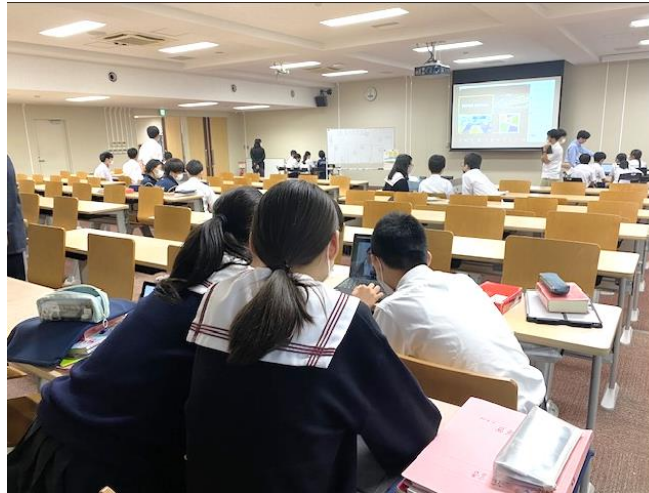
Each group practiced Covid-19 social distancing measures

21 eighth grade students from Burwood GHS, Australia