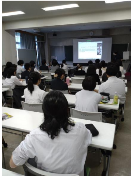
Listening to the SOTA side explain the exchange

Katakura High School students explaining the works of their Sculpture and Arts Course