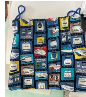
Hand-made cloth bag by a student in the Hobby Group.