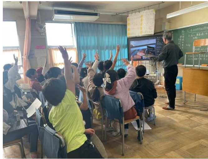
Students actively participating in the class