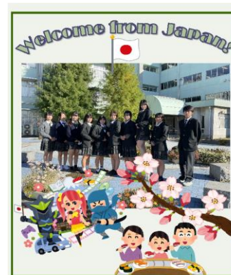
School photo and self-introductions by Josui High School students