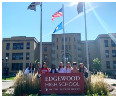
Edgewood High School students