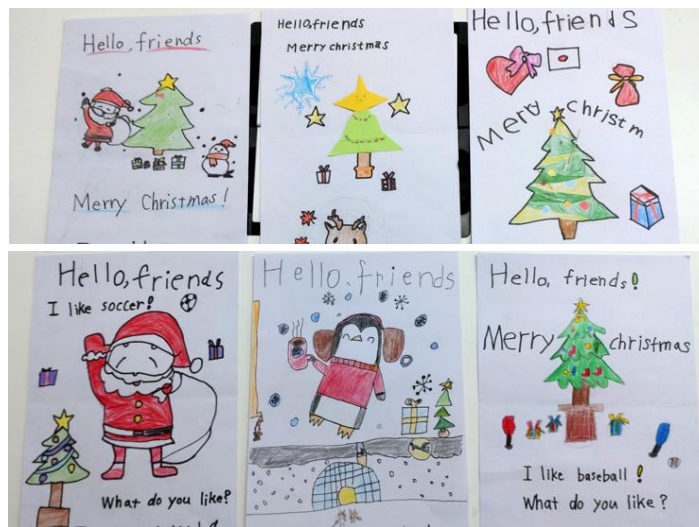
Colorful Christmas cards prepared by Kashima Elementary School students