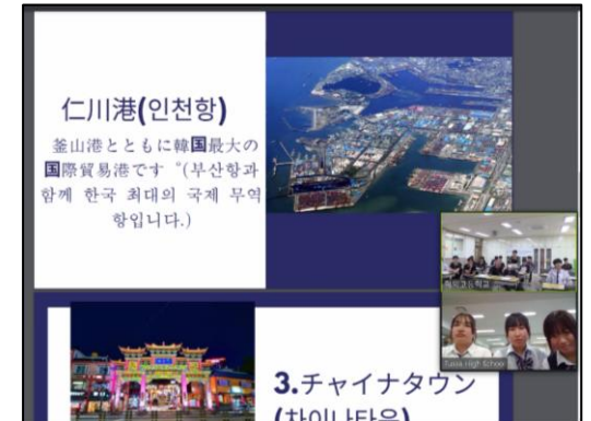
Introduction of Incheon by the Korean students