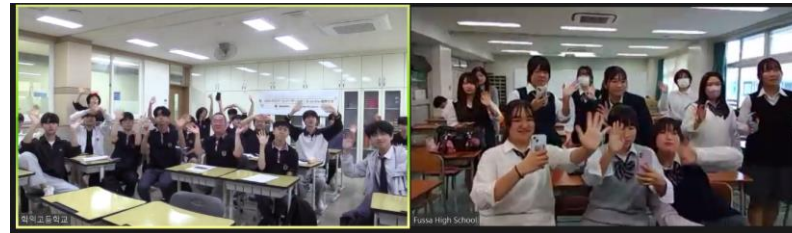
Farewells from the both sides