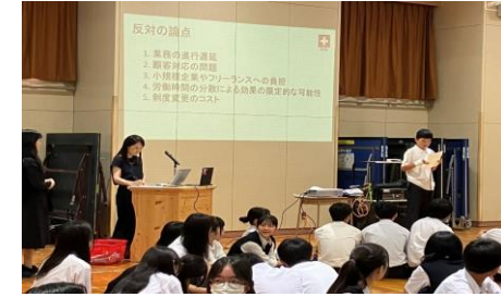
Voting results announced by student representatives