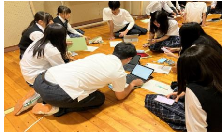
Students at the workshop