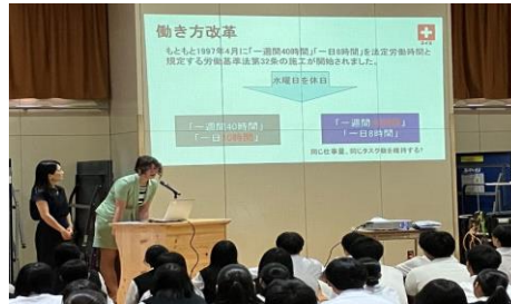
Explanation of the topic by the embassy