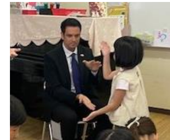
Japanese finger play