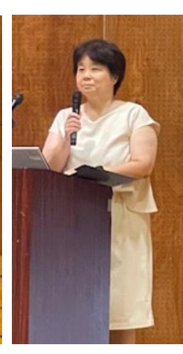
The principal in an ancient Greek-like dress