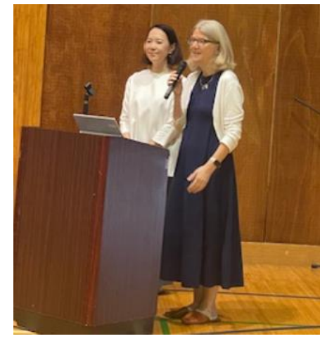
Answering questions from students