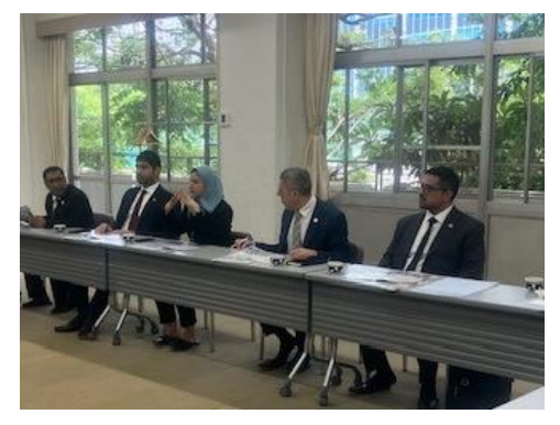
UAE delegation eager to ask questions