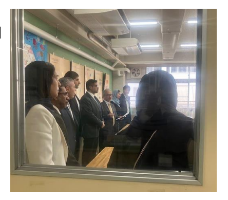
Observation of a class

Her Excellency Sarah Bint Yousif Al Amiri, Minister of State for Public Education and Advanced Technology, and 5 officials from the United Arab Emirates