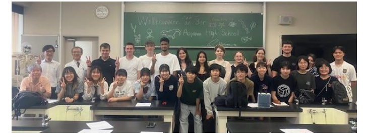
Sharing ideas with the Biology Club students